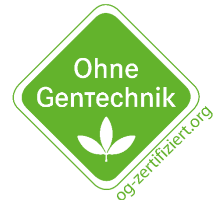
"Ohne GenTechnik"-seal with URL