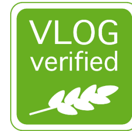
Variant "VLOG verified"

Both the English and the German version can be used abroad. This does not require consultation with the VLOG office.