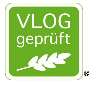
Figure 2: Seal for feed certified in accordance with the VLOG Standard

The English version of the seal reads: "VLOG verified". No other translations are permitted.