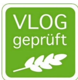
Figure A 3: “VLOG geprüft” seal for feed

To use the “VLOG geprüft” seal a licence agreement must additionally be concluded with VLOG. The basis for this licence agreement is a certification according with the VLOG Standard or a standard recognised as equivalent.