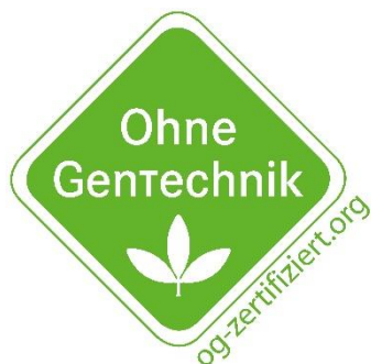
Figure A 2: “Ohne GenTechnik” seal for food

In contrast, the Standard Usage Agreement concluded with VLOG as the holder of the trademark rights governs the use of the word mark “VLOG” for food or animals.